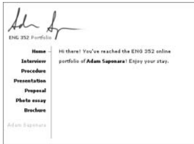
Figure 2. Sample online technical communication portfolio.