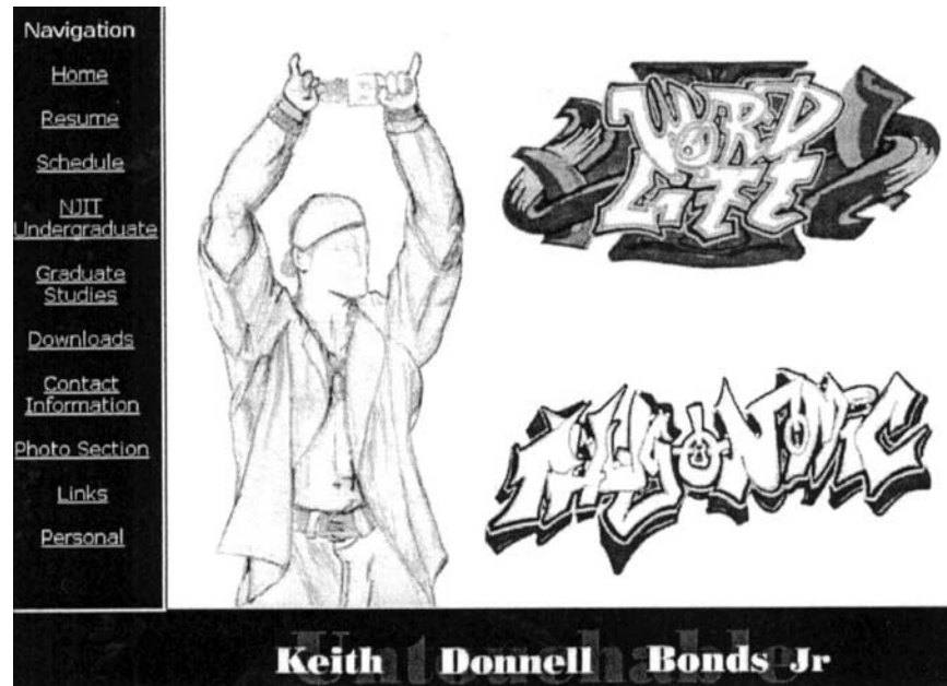
Figure 2. Advanced online portfolio with multimedia, multiple paths, and modes of discourse.

art. It is also more complex in that it has multiple modes within each page and multiple pathways between the pages, resulting in a multi-dimensional hypertext environment.