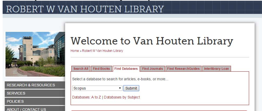
Figure 1. NJIT Library home page

NJIT Library resources can be accessed from NJIT home page ( www.njit.edu ). Select the EDUCATION tab, and then select Van Houten Library menu. This will take you to the NJIT Library home page ( Figure 1 ). From this page you can select "FIND DATABASES" tab. Click for the dropdown menu and select Scopus and press the submit button.