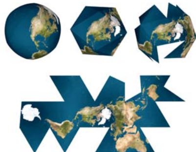
Figure 6.12 Dymaxion Map—an unfolding of a projection of earth onto an icosahedron.