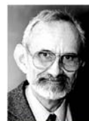
Robert F. Curl Jr.