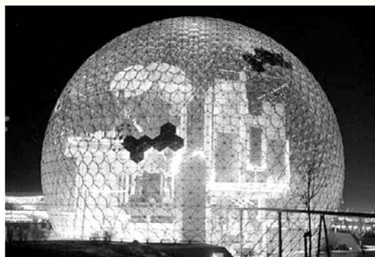
Figure 6.13 Geodesic Dome— from the U.S. Pavilion at Montreal Expo 67.