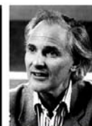
Sir Harold W. Kroto