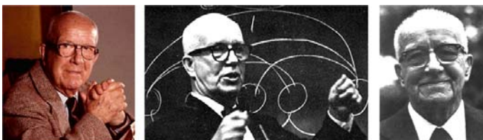
Figure 6.5 Three photographs of R. Buckminster Fuller.

Copyright © 2008 Pearson Education, Inc. Publishing as Pearson Addison-Wesley