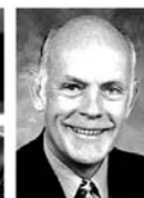
Richard E. Smalley