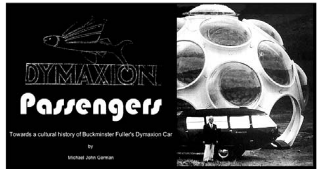
Figure 6.4 Splash page for the Dymaxion Passengers site, sh1.stanford.edu/Bucky/dymaxion/ , showing the Dymaxion Car and Fuller’s Fly’s Eye house.