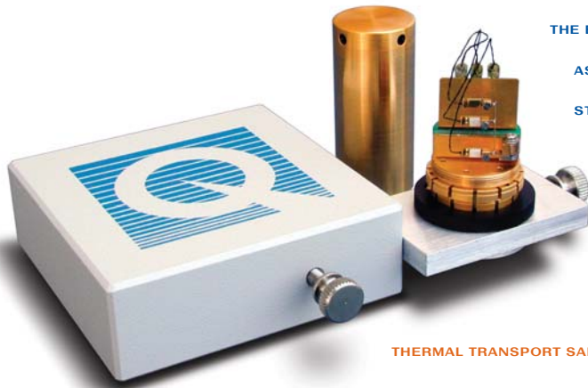
THERMAL TRANSPORT SAMPLE STATION

IN MEASURING THE THERMAL TRANSPORT PROPERTIES OF A MATERIAL SPECIMEN - SUCH AS THERMAL CONDUCTIVITY \kappa AND SEEBECK COEFFICIENT \alpha - A RESEARCHER CAN LEARN CONSIDERABLE INFORMATION ABOUT THE ELECTRONIC AS WELL AS THE IONIC LATTICE STRUCTURE OF THAT SPECIMEN.